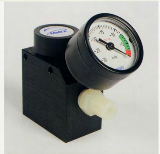
MATRIX VACUUM CONTROL GAUGE