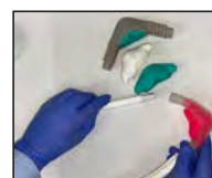
1. Disconnect old mask from breathing circuit.