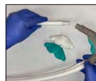
2. Connect new Porter mask to breathing circuit.