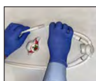
2. Connect Universal Conversion Kit to breathing circuit.