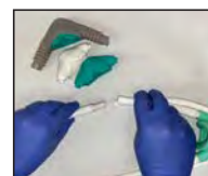
1. Disconnect old mask from breathing circuit.