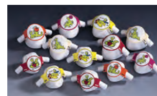
Dynomite Single-Use Scented Nasal Hoods