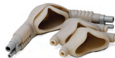
Porter Double Mask Autoclavable