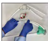
1. Disconnect old mask from breathing circuit.