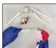
1. Disconnect old mask from breathing circuit.