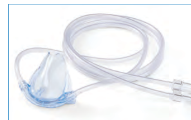
Silhouette Single-Use Nasal Hood And Breathing Circuit