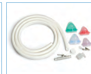
Silhouette Retro Kit