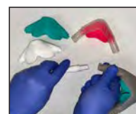
2. Connect new Porter mask to breathing circuit.