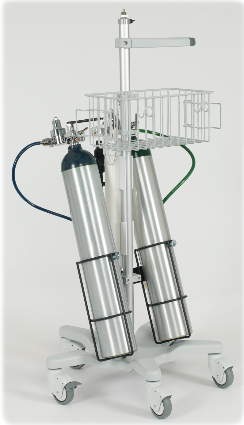
Two-cylinder mobile cart (Cylinders are not included)

The Porter 2-Cylinder Mobile Cart is the latest free-standing mobile cart from Porter. Benefits of the new design include: