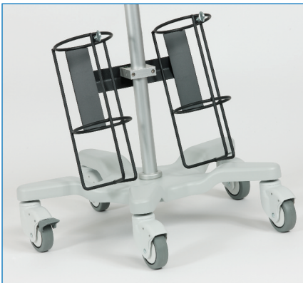
Dual Cylinder Basket