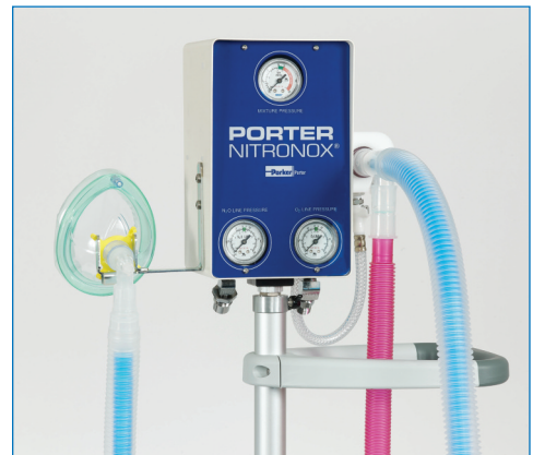
Porter Nitronox™ mounted