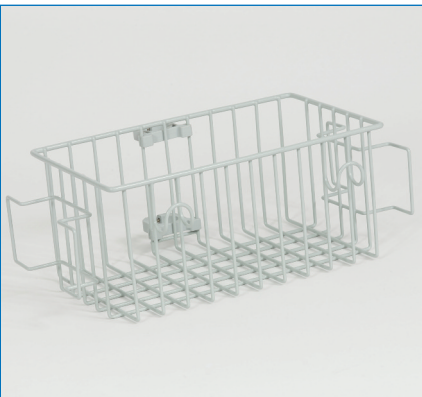
Convenient Storage Basket