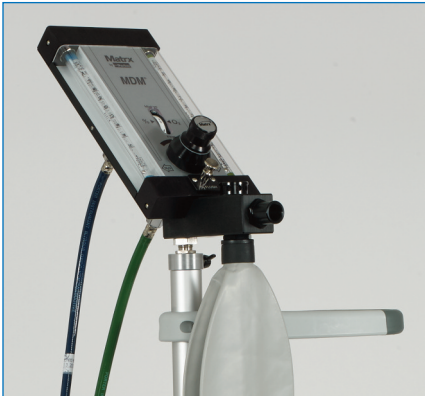
Matrix MDM Flowmeter