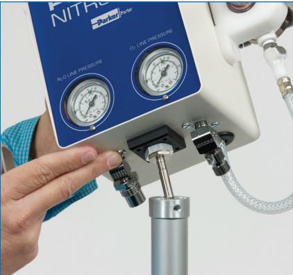
Easily Mount All Devices