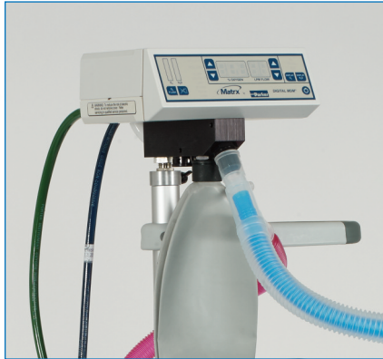
Matrix Digital MDM Flowmeter